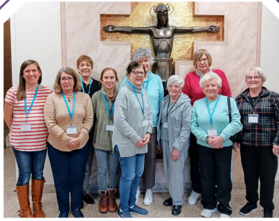
Ten women from the parish attended the Lenten retreat at the Passionist Retreat Center March 21-23. All enjoyed this faith filled break.

Between October 1, 2024, and February 28, 2025, your generous gifts enabled St. Paul of the Cross' St. Vincent de Paul Society to bring Christ's love and mercy to 81 families (214 individuals) in our parish community, providing $12,702 for food and $26,163 for rents, utilities, etc. The "Fifth Sunday" collection next weekend will allow us to continue those efforts in our community. Please keep these families in your prayers.